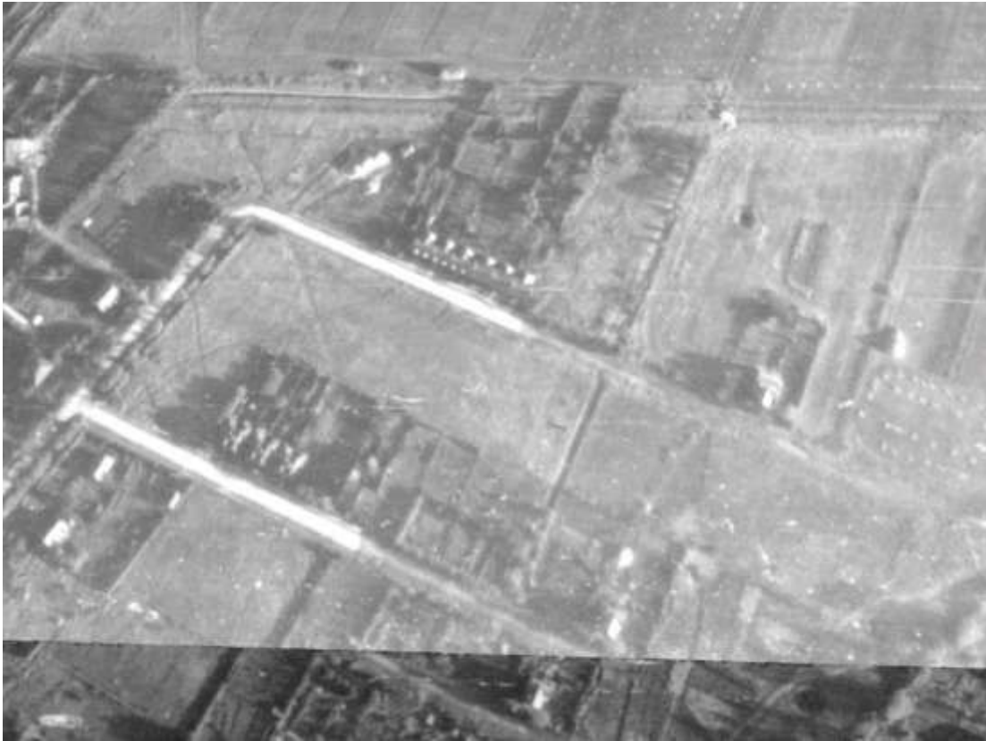
Plate 1. Aerial c.1940