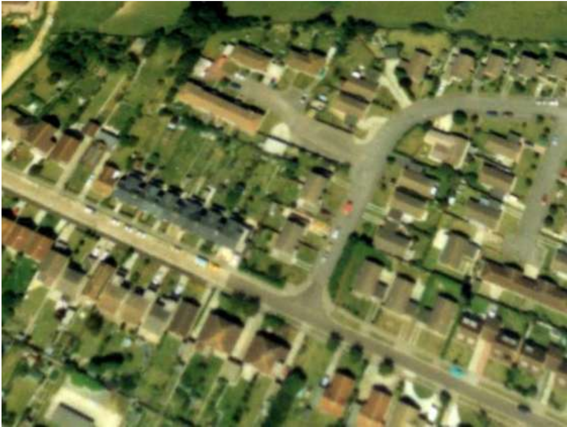
Plate 3. Aerial c. 1990