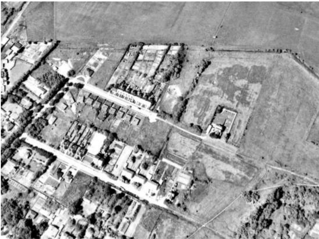
Plate 2. Aerial c. 1960